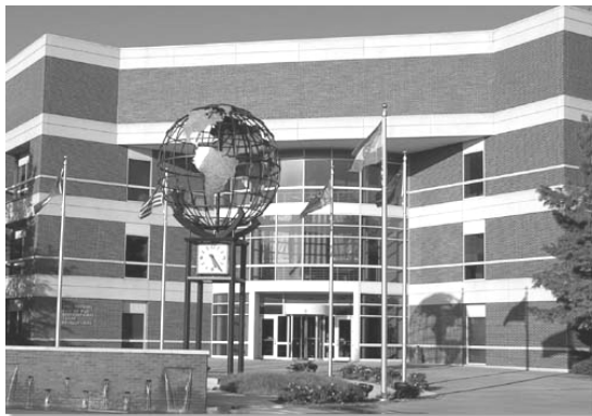
Wes Watkins Conference Center Oklahoma State University

Tickets for the event are a real value, especially if members take advantage of early bird discounts. If purchased between January 1 and February 28, the cost of an indi-