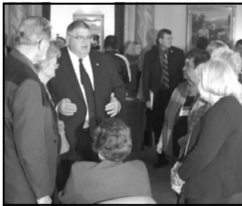
OREA Lobbyists visiting with Senator Johnnie Crutchfield

pass SB 1350, a bill aimed at guaranteeing fair and equal COLAs for retired educators. Although a minor flap over one lawmaker's proposal to restore the bill's title caused the measure to be laid over for later consideration, the bill managed to pass the Senate on a vote of 41-1 a week later. Upon clearing the Senate, SB 1350, by Don Barrington (R, Lawton) was sent to the House of Representatives.