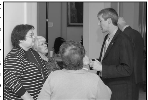
Rep. Corey Holland with OREA Lobbyists

Despite the large turnout, the event was carried out seamlessly. Members handed over OREA legislative palm cards (outlining the Association's legislative goals) to all legislators with whom they met, and left behind yellow visitation cards for those they were unable to see. Making communication easier, members were identified by personalized name badges bearing the OREA logo. Advanced briefing materials had been mailed to participants the week before, but were augmented by an up-to-date briefing sheet the day of the event. Many members also enjoyed the shuttle bus transportation to and from the Capitol, provided by OREA.