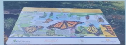
Monarch Life Cycle

Rue: Food for Swallowtail Butterfly Caterpillar