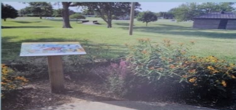
2020 Monarch/Pollinator Garden By Children's Playground Central Park 1500 S Main, BA

Milkweed: Only Home & Food For Monarch Caterpillars